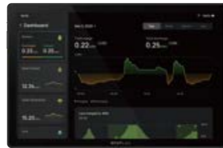
Battery Charge and Discharge