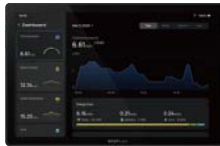
Home Energy Consumption